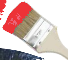
Exhibit the easy way and relax with SB EXPO INTERNATIONAL a day before the show starts. Experience a complete event success with support from our flexible team and high quality products, We Offer custom-made and Octanorm modular designer stands of the highest standards guaranteeing customer satisfaction every time.

EXHIBITION PARTICIPATION ENSURES EFFECTIVE COMMUNICATION OF VITAL SALES AND CORPORATE MESSAGES.